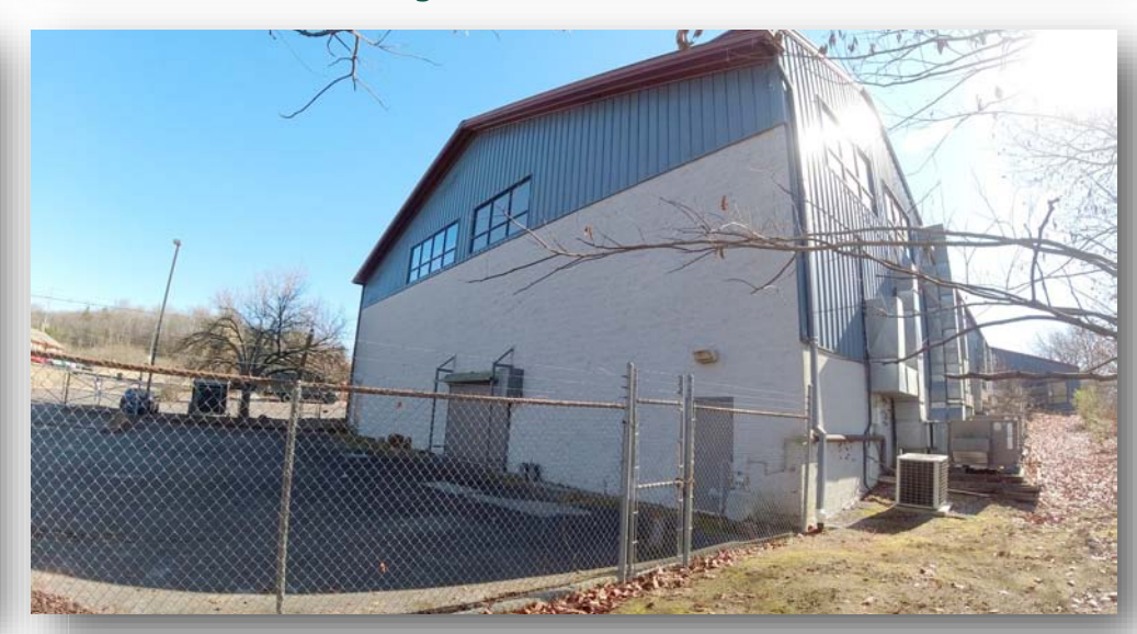
North End of Building Lower Level Entrance