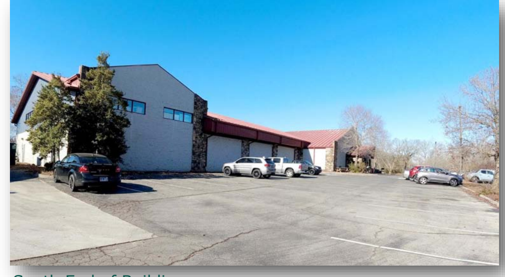
South End of Building