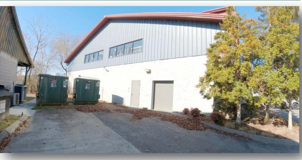
South End of Building