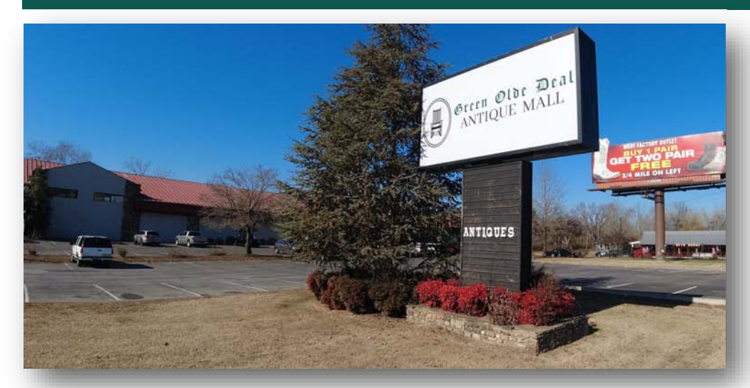
Winfield Dunn Parkway Signage